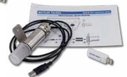
WiFi Kit, Remotely mounted [30499149]