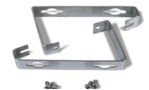
Wall Mounting Brackets [Included with harsh terminal]