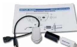
WiFi Kit, Terminal mounted [30499148]