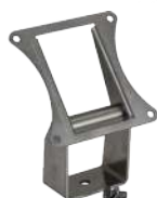
Positionable Bracket [22020286]