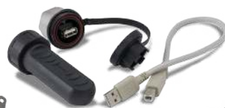
USB Extension Kit [30139559]