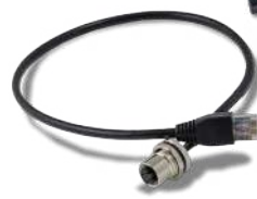
Ethernet Extension Kit [30139561]