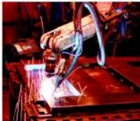
Scales are manufactured to strict quality standards in our ISO 9001 certified plant.

For the ultimate in quick and easy setup, we can supply your VLC floor scale with a terminal that is wired and calibrated at the factory. This option makes the scale fully operational right out of the box, so that you can set it up and start weighing immediately. Choose from a desk/wall HAWK terminal or a stainless steel HAWK or PANTHER PLUS terminal for harsh environments.